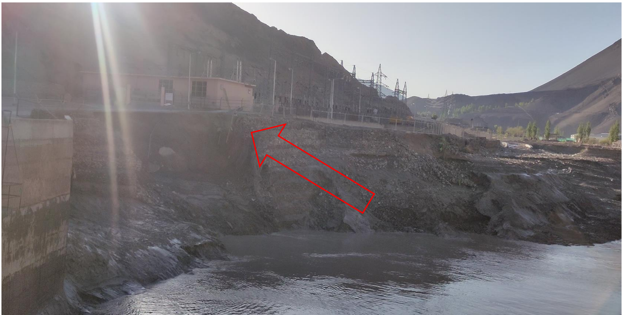
Reservoir right bank retention wall collapse (near switchyard) during flushing