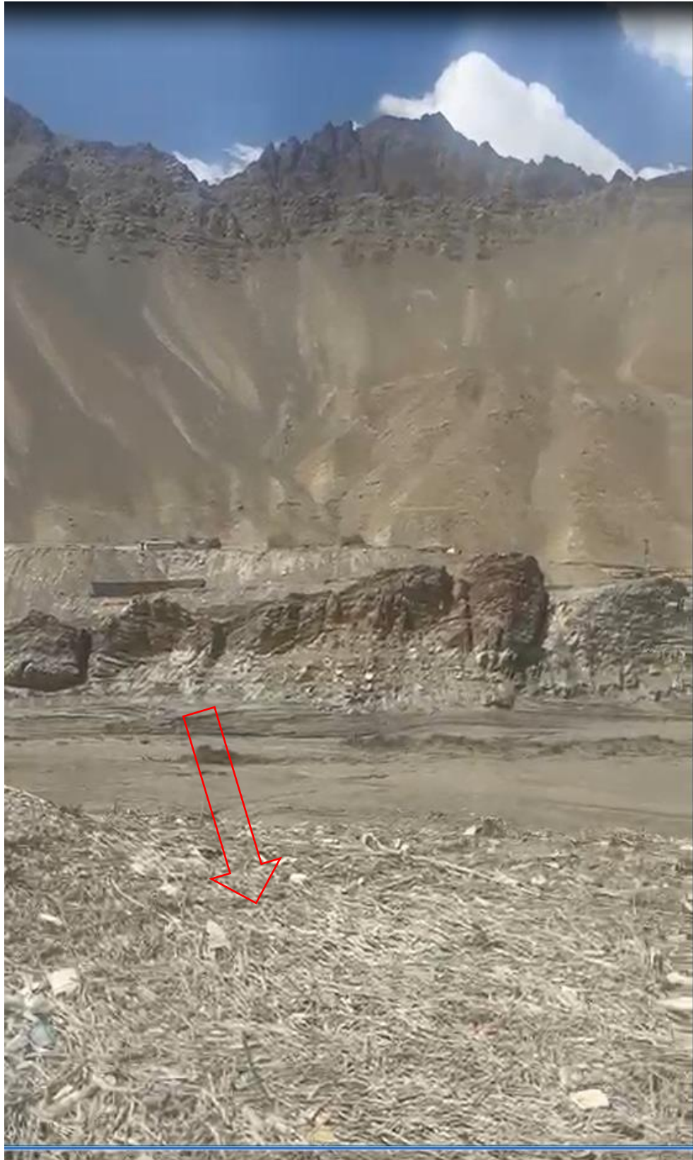
Reservoir filled with branches, plastic bottles, sacs, polythene and other unwanted materials