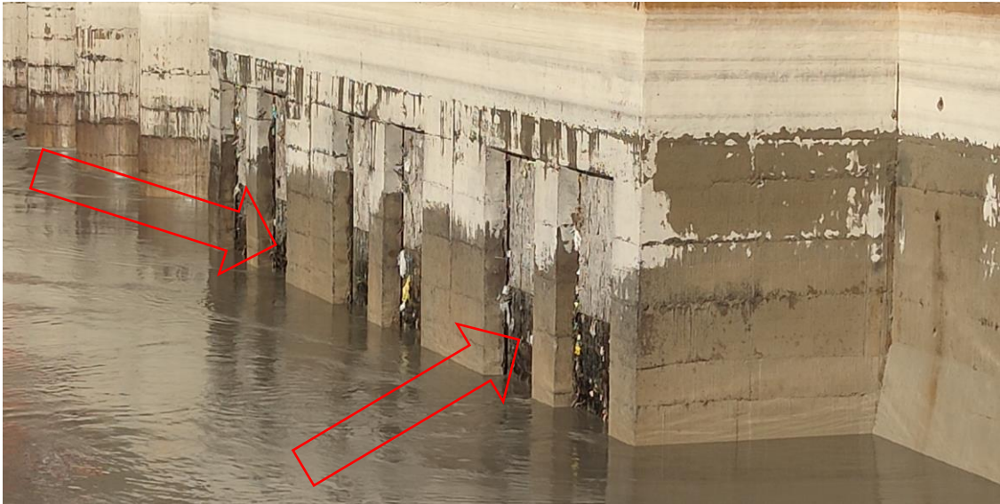
Trash Rack filled with branches , plastic bottles, sacs, polythene and other unwanted materials