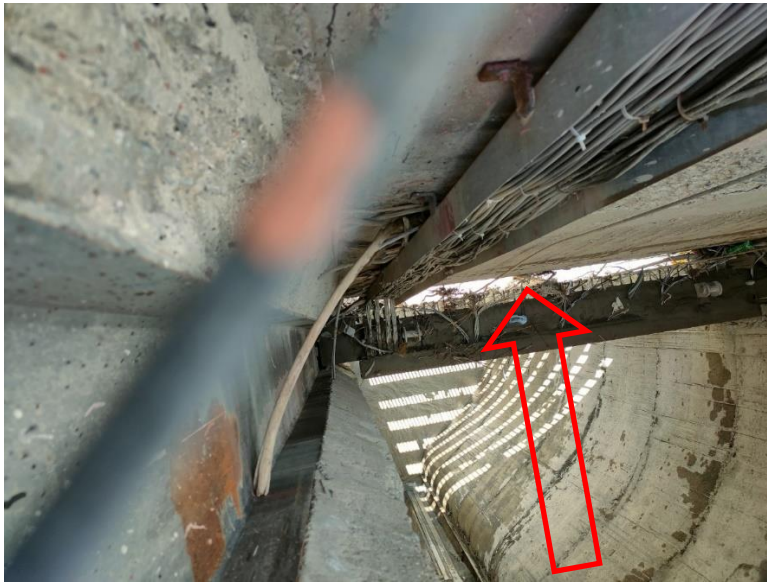
Top view of trash rack filled with branches