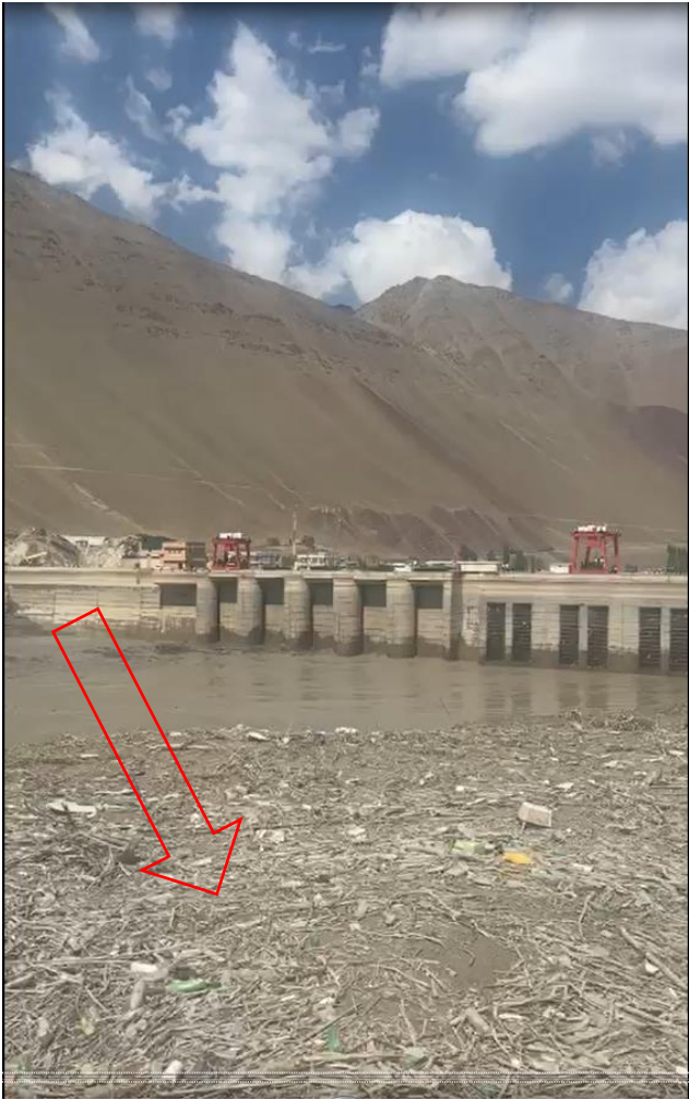
Reservoir filled with branches, plastic bottles, sacs, polythene and other unwanted materials