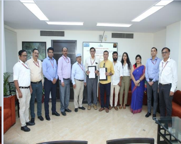
Shiksha Rath 7.0: NHPC's Transformative CSR Endeavor Empowering Children and Communities in Seven Border Villages along the LOC in Ladakh

An MoU has been signed with Adhyatmik Sanskriti Sewa Mission, Delhi on 22.08.2024 for implementation of this CSR initiative. The Scope of Work involves the procurement and installation of Ophthalmic Equipment - A Scan Machine with 3-year warranty at JIWO Charitable Eye Care and Multi-Specialty Hospital, Rohini, Delhi. The total Sanctioned Cost is ₹ 6.00 Lakh.