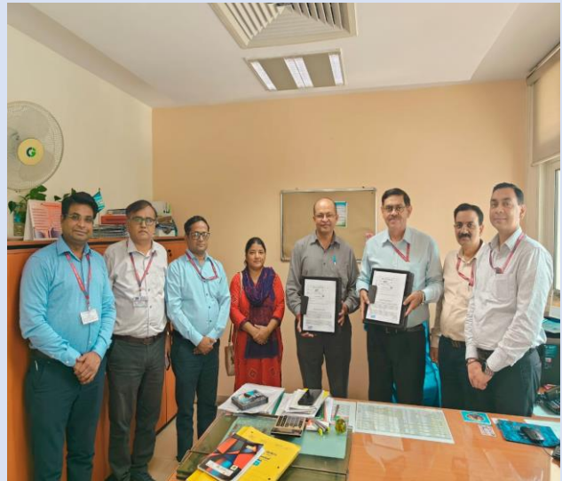
Empowering Women's Health: NHPC's CSR Initiative for Awareness, Distribution of 'Saukhyam Reusable Pads,' and Installation of Pad Vending Machines in 20 Schools/ Colleges across Pithoragarh and Champawat Districts, Uttarakhand