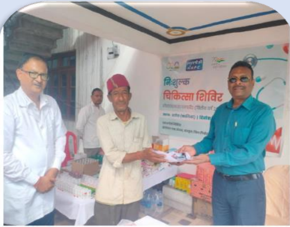
बसोरा (कालिका) में चिकित्सा शिविर

During FY 2023-24, 5 nos. medical camps were organised by Dhauliganga Power Station for the local rural populace of 5 places villages namely Basora (Kalika), Chhirkila (Jamku), Shyankuri, Phultari (Nigalpani) & Madkot( Munshyari) in Dharchula Area in Pithoragarh District in the state of Uttarakhand. At Phultari, medical camp was organized on 21.02.2024 and medical camp was organized at Madkot on 09.03.2024.