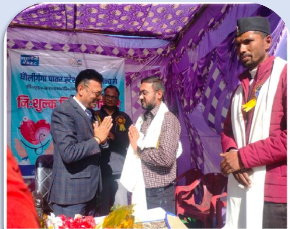
स्यांकुरी गाँव में चिकित्सा शिविर