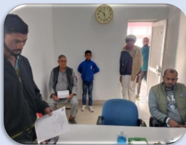
Baira Siul PS