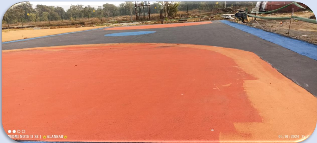
Multipurpose outdoor court

An MOU has been signed on 27.02.2023 and the first instalment of Rs.9.15 Lakh has been released as an advance. The work of Multipurpose Court, Kabaddi & Kho-Kho Kids Play Area and Obstacle Course is under progress. The no. of beneficiaries is approx.700.