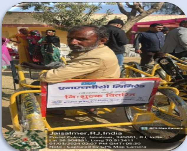
Jaisalmer, RJ, India Postal Colony, Jaisalmer, 345001, RJ, India Lat 26.904991, Long 70.913411 01/03/2024 02:07 PM GMT+05:30 Note: Captured by GPS Map Camera