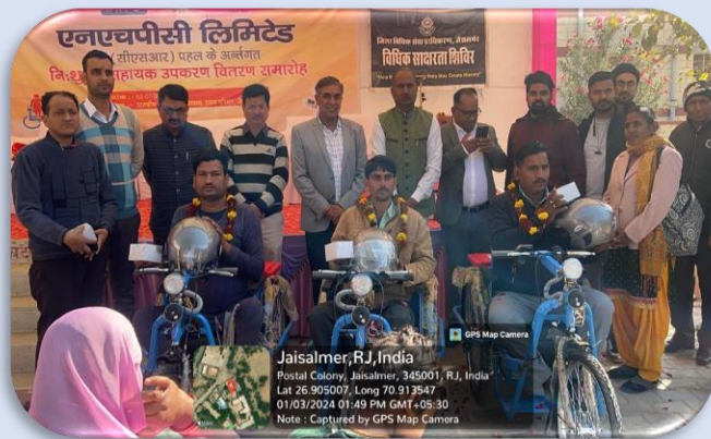
Jaisalmer, RJ, India Postal Colony, Jaisalmer, 345001, RJ, India Lat 26.905007, Long 70.913547 01/03/2024 01:49 PM GMT+05:30

On 3 rd and 4 th January 2024, Aids and assistive devices such as Motorized Tricycle, Joystick, Wheel Chair, Artificial limb, Caliper, Hearing Aid, Braille kits, etc were distributed among 130 Divyangjans in Jaisalmer, Rajusthan.