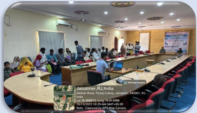
Jaisalmer, RJ, India Gadisar Road, Postal Colony, Jaisalmer, 345001, RJ, India Lat 26.998673, Long 70.913998 10/13/2023 10:29 AM GMT+05:30 Note: Captured by GPS Map Camera