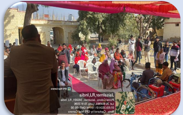
Jaisalmer, RJ, India Postal Colony, Jaisalmer, 345001, RJ, India Lat 26.905007, Long 70.913547 01/03/2024 01:49 PM GMT+05:30