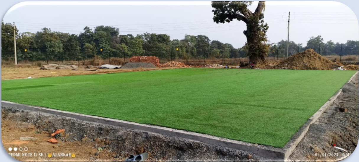
Kids Play Area