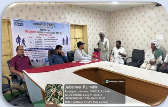
Jaisalmer, RJ, India Fatehgarh, Jaisalmer, 345027, RJ, India Lat 26.999986, Long 71.204479 10/06/2023 01:17 PM GMT+05:30 Note: Captured by GPS Map Camera