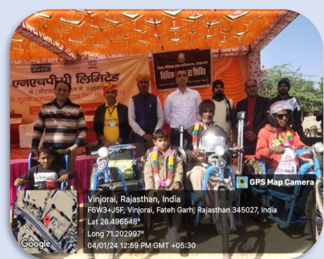
Vinjorai, Rajasthan, India F6W3+J5F, Vinjorai, Fateh Garh, Rajasthan 345027, India Lat 26.496548° Long 71.202997° 04/01/24 12:59 PM GMT +05:30