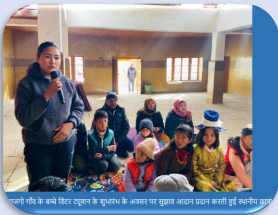
गजगो गाँव के बच्चे विटर ट्यूशन के शुभारंभ के अवसर पर सुझाव आदान प्रदान करती हुई स्थानीय छात्रा