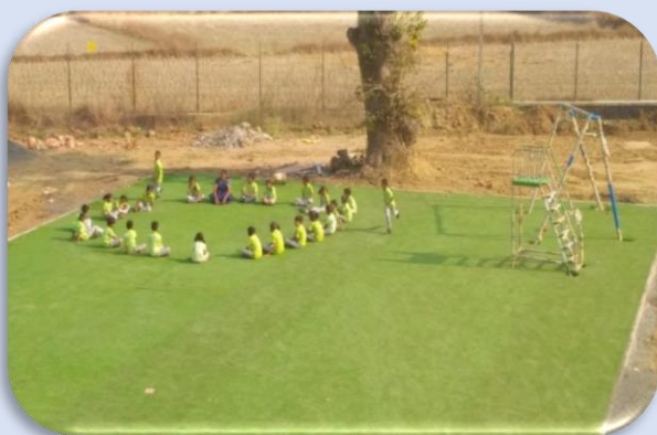
Multipurpose outdoor court

An MOU has been signed on 27.02.2023 and the first instalment of Rs.9.15 Lakh has been released and utilized. The work of Multipurpose Court, Kabaddi & Kho-Kho Kids Play Area and Obstacle Course is under progress. The no. of beneficiaries is approx.700.