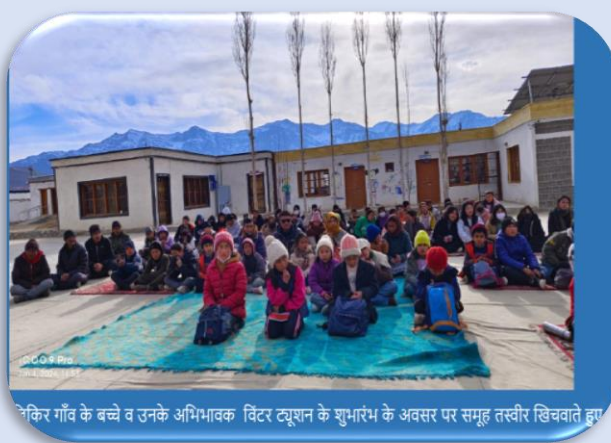
किर गाँव के बच्चे व उनके अभिभावक विटर ट्यूशन के शुभारंभ के अवसर पर समूह तस्वीर खिचवाते हुए